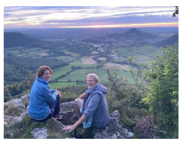
View from the "Girl's Rock" over the Swabian landscape

Most of our FFF participating ladies brought either club gliders or their own ones, like LS4, Discus or DG100, flew with our flight-instructors in our ASK21, Duo-Discus or even with our Ultra-light double seaters Bristell, Remos G3 and Dynamic WT9. Thursday and Friday were sunny and led to flights that lasted a little longer than an hour, and the participants were able to enjoy the beautiful landscape with the middle-sized mountain ridges, the edge of the Swabian Alb. As another highlight on Friday evening, shortly before our final Party-barbeque, two participants in their Micro performed a nice little formation flight with their Piccolo-Ultralights. Finally, after the final barbecue-dinner, we walked to the "Maedlesfelsen" – translated the "Girls-Rock" and watched a very romantic sunset on the "Alb-Vorland",(the piedmonts of the Alb) where we could see the Black Forest in the west and the Stuttgart Television-Tower in the north.